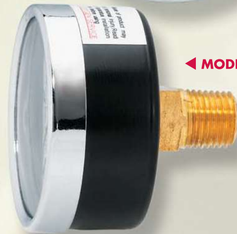
◀ MODEL 20TC